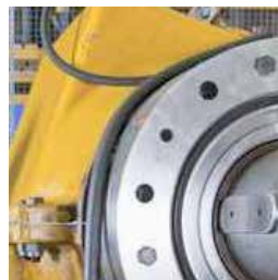
Gear motors, grinding mills