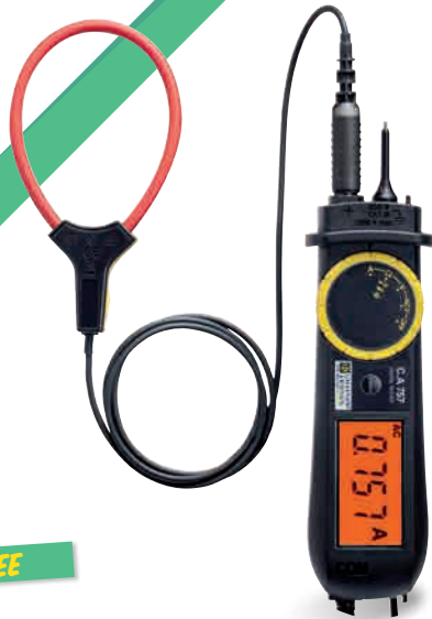
Voltage, current & continuity tester CA 757