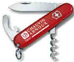
Swiss Army knife