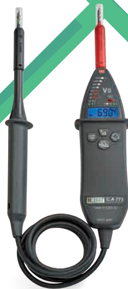
Voltage Absence Testers