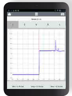
Android tablet 8" - 16 GB