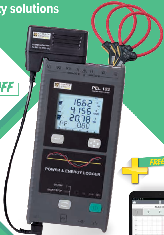
Power logger PEL103