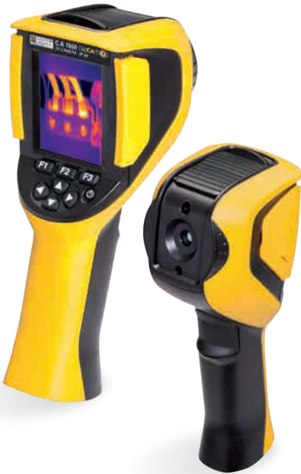
Thermal camera CA 1950

Energy performance and electrical safety solutions