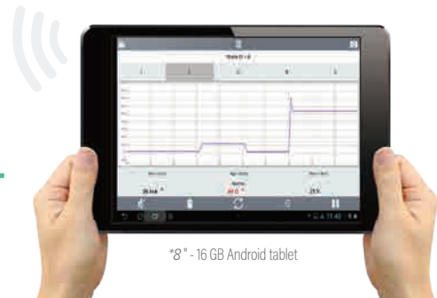
*8" - 16 GB Android tablet